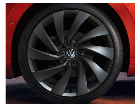
OPTIONAL ON R-LINE 20" 'Rosario' black alloy wheels 8J x 20 Tyres: 245/35 R20