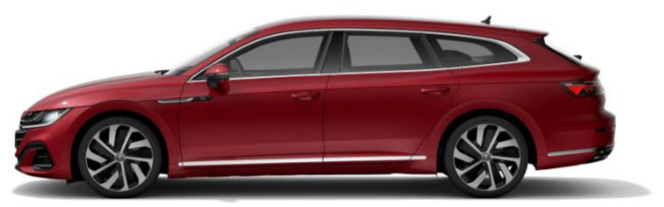
The above image shows optional Kings Red metallic paint

The above specifications are for information purposes only as our products are continually updated and changes may be made to the specifications at any time. If you require any specific feature, you must consult your local dealer who is regularly updated with any change in specification. Specifications are subject to change without notice. Effective from 25 May 2021, for production from CW48/2020 onwards. All prices include VAT and VRT. These prices are subject to change once technical