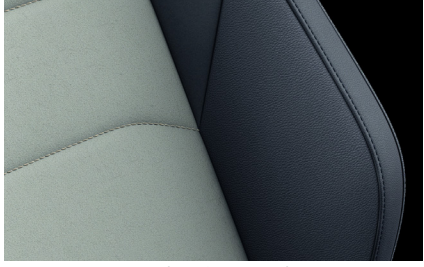
"ArtVelours Microfleece/Vienna" cloth & leather Mistral/Raven (YS) Optional on Elegance models