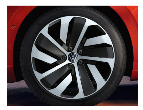
STANDARD ON R-LINE 19" 'Montevideo' alloy wheels 8J x 19 Tyres: 245/40 R19