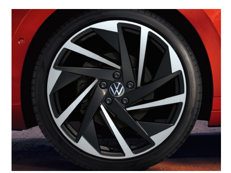
OPTIONAL ON ELEGANCE & R-LINE 20" 'Nashville' alloy wheels 8J x 20 Tyres: 245/35 R20