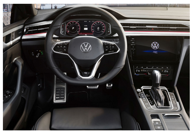
The above images show optional "Nappa" leather pack R-Line, with optional ErgoComfort seats