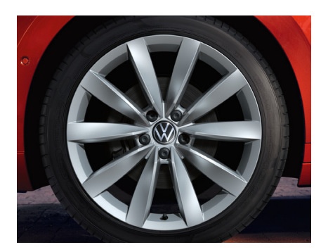
OPTIONAL ON ELEGANCE 19" 'Chennai' alloy wheels in Adamantium Silver 8J x 19 Tyres: 245/40 R19