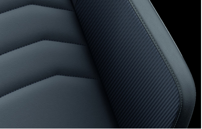
"R-Model Nappa/Carbon" leather* Titan Black (OH) Standard on R Model