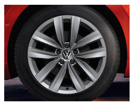
OPTIONAL ON ARTEON & ELEGANCE 18" 'Almere' Adamantium Silver alloy wheels 8J x 18 Tyres: 245/45 R18