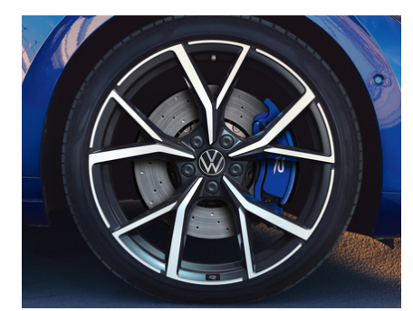
OPTIONAL ON R-MODEL 20" 'Estoril' alloy wheels 8J x 20 Tyres: 245/35 R20

The addition of optional extras may result in the vehicle increasing in Co2 g/km and therefore, attracting a higher rate of VRT than described in this product guide. For your exact configuration value, both Co2 g/km and RRP, please visit volkswagen.ie configurator.