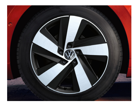
STANDARD ON ARTEON SHOOTING BRAKE 18" 'Valdemossa' alloy wheels 8J x 18 Tyres: 245/45 R18

The addition of optional extras may result in the vehicle increasing in Co2 g/km and therefore, attracting a higher rate of VRT than described in this product guide. For your exact configuration value, both Co2 g/km and RRP, please visit volkswagen.ie configurator.