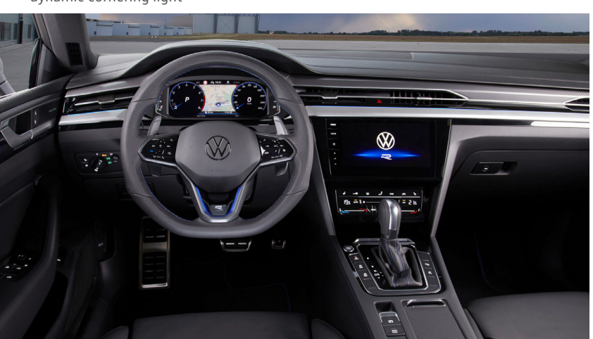
The above image shows optional Navigation System Discover Pro 9.2" display