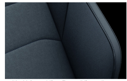
"ArtVelours Microfleece/Vienna" cloth & leather Titan Black (TO)