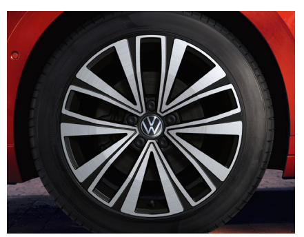
STANDARD ON ELEGANCE 18" 'Muscat' alloy wheels in 8J x 18 Tyres: 245/40 R18