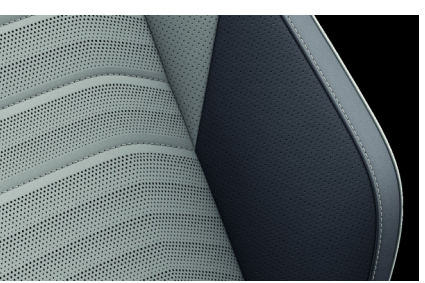
"Nappa" leather * (WL6) Mistral/Raven (YS) Optional on Elegance models