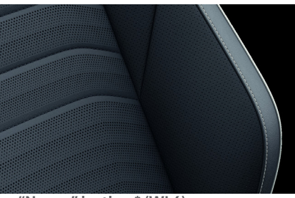
"Nappa" leather * (WL6) Titan Black (TO) Optional on Elegance models

* Optional at extra cost. • Please note, the print processes do not allow exact reproduction of the upholstery colours.