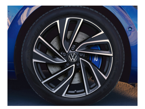
STANDARD ON R-MODEL 19" 'Adelaide' alloy wheels 8J x 18 Tyres: 245/45 R18