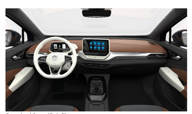
Standard from ID.4 City Not available on ID.4 Max Soul/Electric White/Florence Brown