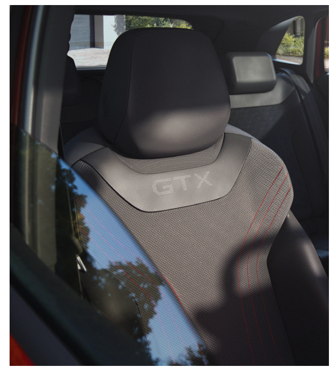
GTX Cloth/Leatherette Soul/Flash Red Standard on ID.4 GTX Business