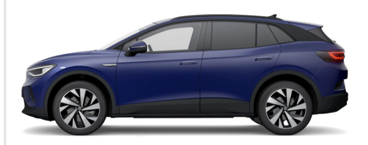
Blue Dusk Metallic1,2