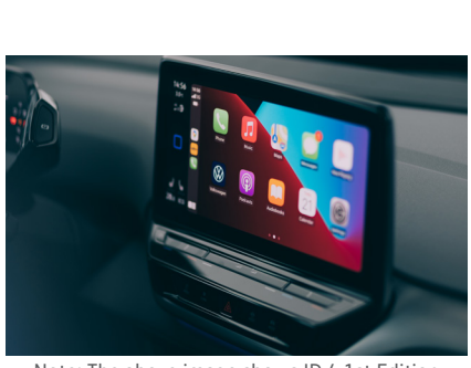
Note: The above image shows ID.4 1st Edition interior