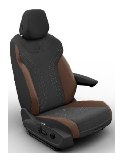
Artvelours Microfleece/Leatherette Soul/Florence Brown Standard from ID.4 City Electric controls are standard from ID.4 Tech, and optional on ID.4 Style, Business and Family