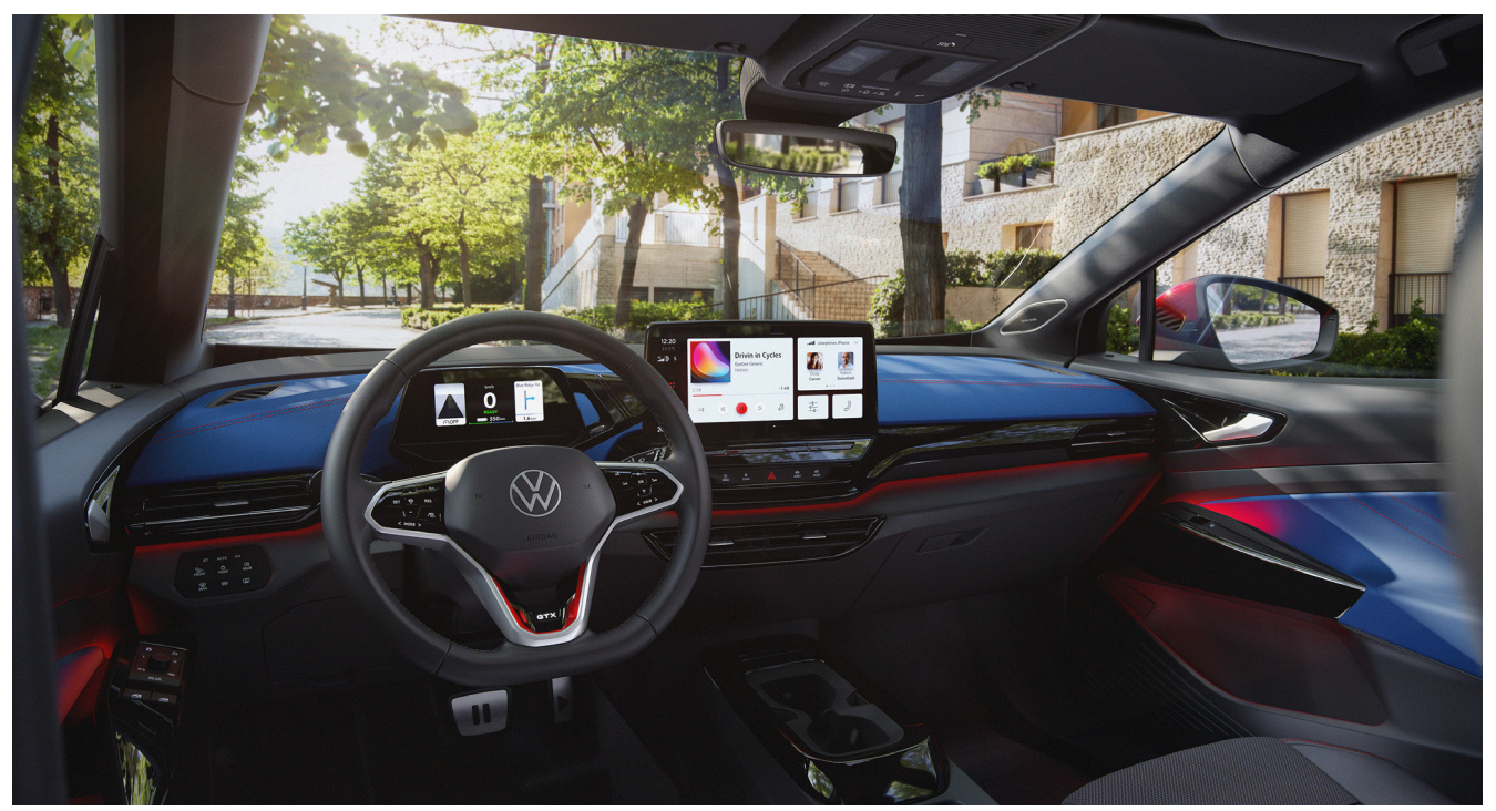
Standard on ID.4 GTX Business & GTX Max