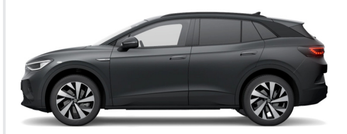
Manganese Grey Metallic<sup>1</sup>