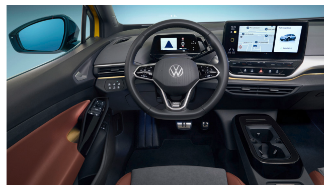
Standard on ID.4 1st & 1st Max