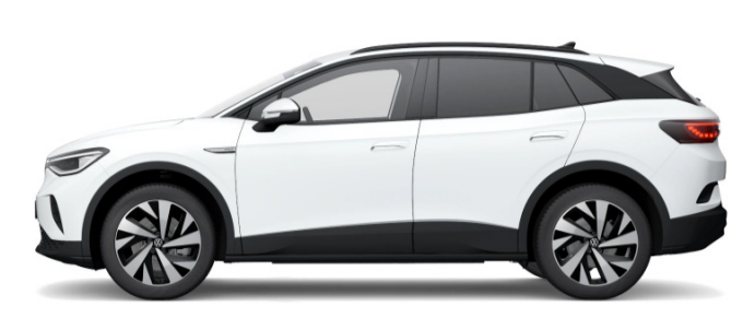
Glacier White Metallic¹