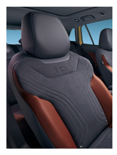
Artvelours Microfleece/Leatherette Platinum Grey/Florence Brown Standard on ID.4 1st & 1st Max