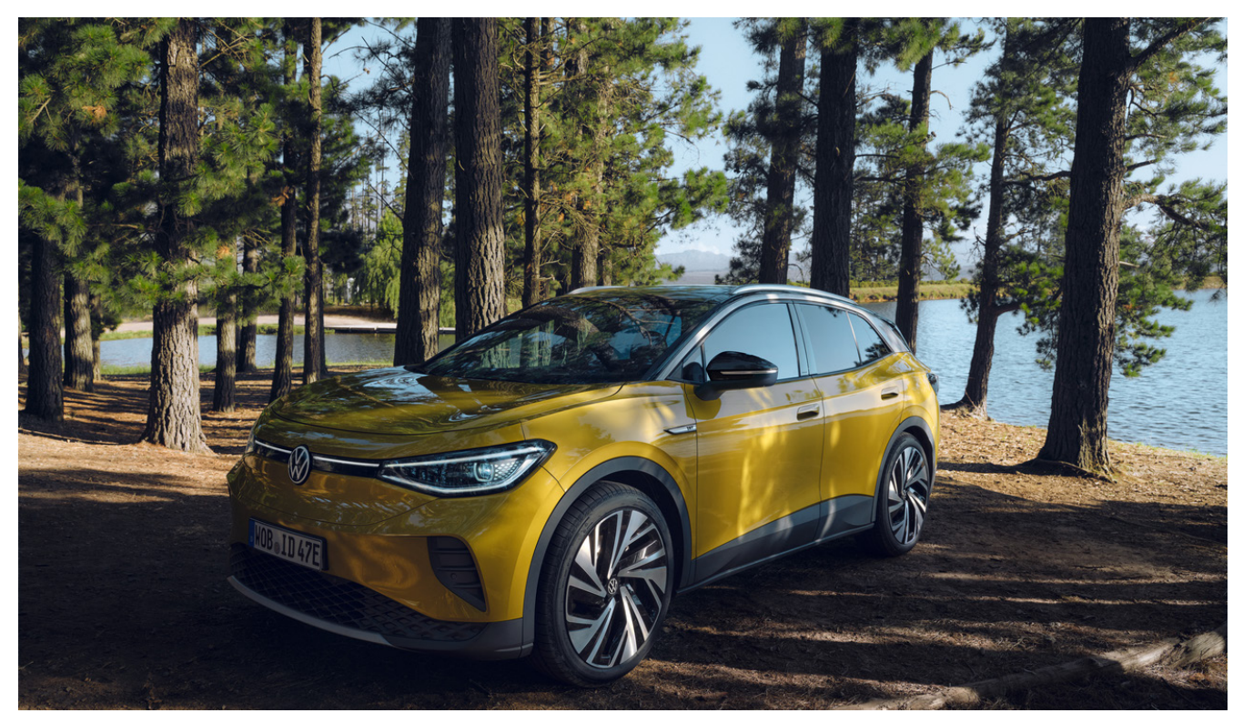
Note: The above image shows ID.4 1st Max

Private RRP: €55,565¹ Commercial RRP: €60,565²