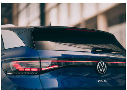
Note: The above image shows optional Bi-Colour Styling Package