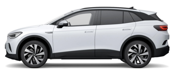
Scale Silver Metallic1