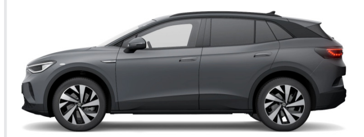
Moonstone Grey Solid