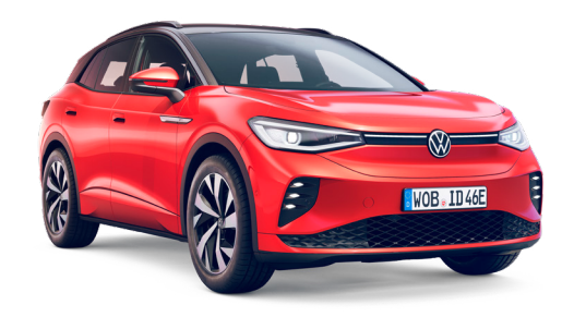
King's Red Metallic1