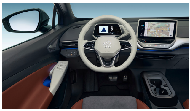
Standard on ID.4 1st