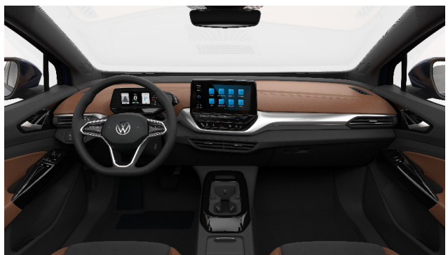
Standard from ID.4 City