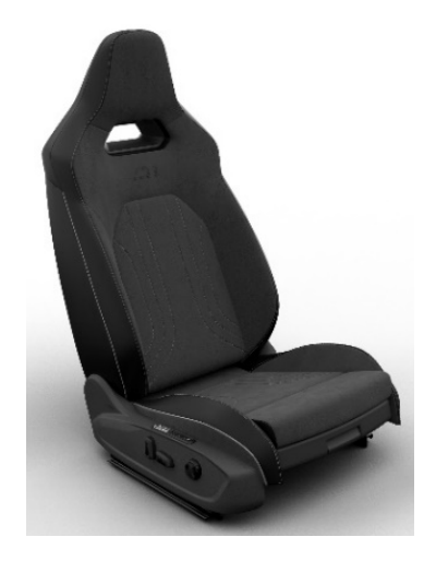
ArtVelours Top Sport Seats Soul Standard on ID.4 Max