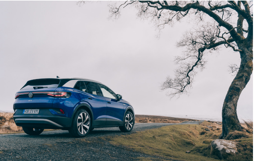
Note: The above image shows optional Bi-Colour Styling Package and 20" 'Drammen alloy wheels

<sup>1</sup>Prices are representative of RRPs after government incentives for private buyers