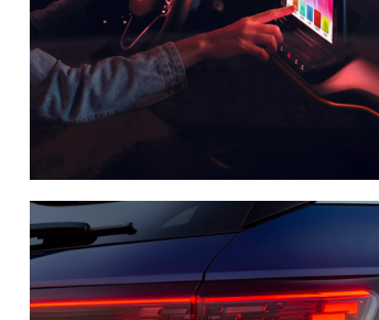
77kWh Battery 519km Range