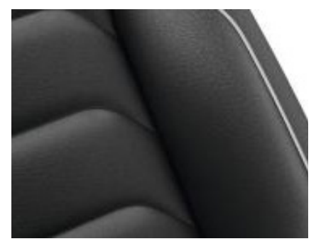
"Vienna" leather (WLR) Titan Black/Crystal Grey (BG) Optional – Comfortline Standard-Highline & R-Line