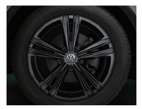
OPTIONAL ON R-LINE (WSR/WST) 19" Sebring alloy wheels in black 8.5J x 19 alloy wheels. 255/45 R19 with low rolling resistance tyres Note: only available in combination with 'Black Style' pack WSR/WST

OPTIONAL ON R-LINE (PJS) 20" Suzuka alloy wheels 8.5J x 20 alloy wheels. 255/40 R20 with low rolling resistance tyres