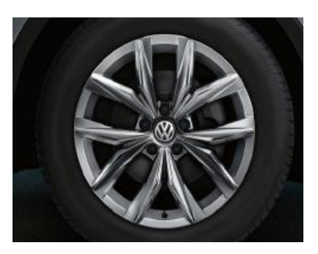
STANDARD ON HIGHLINE 18" Kingston alloys 7.5Jx 18 alloy wheels. 235/55 R18 with low rolling resistance tyres