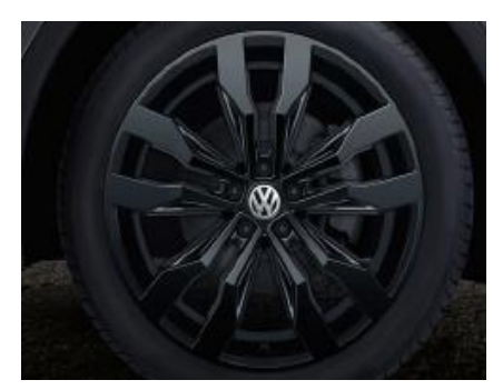
OPTIONAL ON R-LINE (PJB) 20" Suzuka in black finish alloy wheels 8.5J x 20 alloy wheels. 255/40 R20 with low rolling resistance tyres Note: only available in combination with 'Black Style' pack WSR/WST

The addition of optional extras may result in the vehicle increasing in Co2 g/km and therefore, attracting a higher rate of VRT than described in this product guide. For your exact configuration value, both Co2 g/km and RRP, please visit volkswagen.ie configurator.