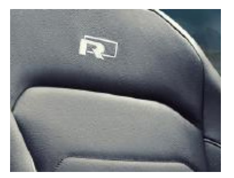
"Vienna" leather with R-Line logo (PL7) Titan Black/Crystal Grey (IH) Optional – R-Line

Please note, the print processes do not allow exact reproduction of the upholstery colours.