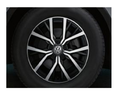
STANDARD ON COMFORTLINE 17" Tulsa alloy wheels 7J x 17 alloy wheels. 215/65 R17 with low rolling resistance tyres

The addition of optional extras may result in the vehicle increasing in Co2 g/km and therefore, attracting a higher rate of VRT than described in this product guide. For your exact configuration value, both Co2 g/km and RRP, please visit volkswagen.ie configurator.