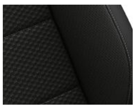
"Lassano" cloth Titan Black (BG) Standard – Comfortline