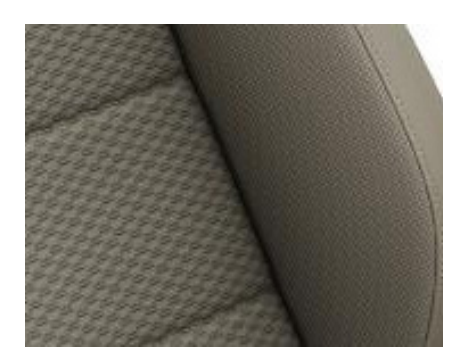
"Lassano" cloth Storm Grey (FY) Standard –Comfortline