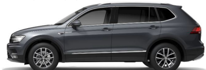
The above image shows optional Platinum Grey Metallic paint

The above specifications are for information purposes only as our products are continually updated and changes may be made to the specifications at any time. If you require any specific feature, you must consult your local dealer who is regularly updated with any change in specification. Specifications are subject to change without notice.