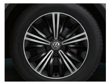
OPTIONAL ON COMFORTLINE & HIGHLINE (PJ2) 18" Nizza alloy wheels 7J x 18 alloy wheels. 235/55 R18 with low rolling resistance tyres

STANDARD ON R-LINE 19" Sebring alloy wheels in 'Grey Silver' 8.5J x 19 alloy wheels. 255/45 R19 with low rolling resistance tyres