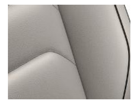
"Vienna" leather (WLR) Storm Grey/Titan Black (FY) Optional – Comfortline Standard-Highline & R-Line