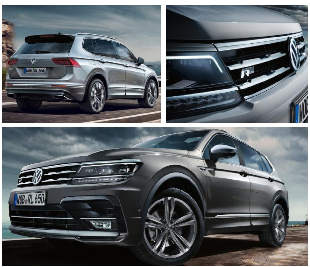
The above image shows optional Pyrite Silver Metallic paint

The above specifications are for information purposes only as our products are continually updated and changes may be made to the specifications at any time. If you require any specific feature, you must consult your local dealer who is regularly updated with any change in specification. Specifications are subject to change without notice.