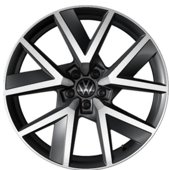
STANDARD ON R-LINE & R EHYBRID 20" 'Braga' alloy wheels, in 'Black' with diamond turned surface

The addition of optional extras may result in the vehicle increasing in Co2 g/km and therefore, attracting a higher rate of VRT than described in this product guide. For your exact configuration value, both Co2 g/km and RRP, please visit volkswagen.ie configurator.