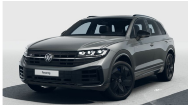
Silicon Gray Metallic