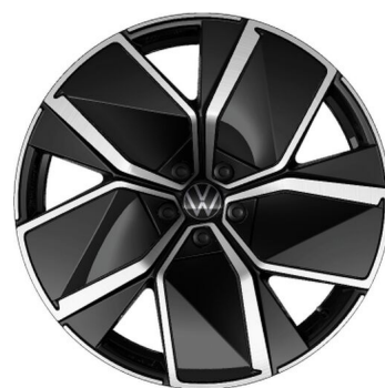
OPTIONAL ON R LINE & R EHYBRID 21" Leeds Alloys Leeds 9.5J x 21, Black, diamond-turned, tires 285/40 R21 PJ5