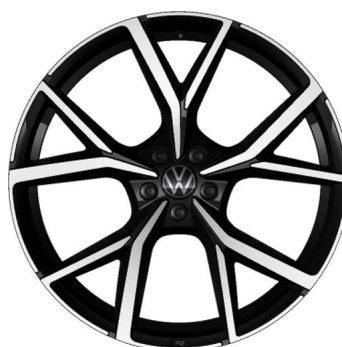
OPTIONAL ON R LINE R EHYBRID 22" Estoril Alloys 'Diamond Turned Surface' Estoril 9.5J x 22, Black, diamond-turned, Volkswagen R, tires 285/35 R22 PJ9