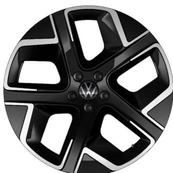
OPTIONAL ON R LINE 20" York Alloy York 9J x 20, Black, diamond-turned, tires 285/45 R20 PJ4