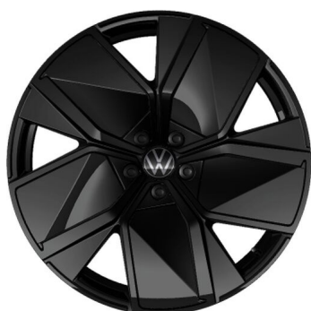
OPTIONAL ON R LINE & R EHYBRID 21" Leeds Alloys 'Black' Leeds 9.5 J x 21 in black, tires 285/40 R 21 PJ6