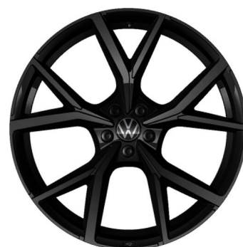
OPTIONAL ON R EHYBRID 22" Estoril Alloys 'Black' Estoril 9.5J x 22, in Black, Volkswagen R, tires 285/35 R22 PJ7

The addition of optional extras may result in the vehicle increasing in Co2 g/km and therefore, attracting a higher rate of VRT than described in this product guide. For your exact configuration value, both Co2 g/km and RRP, please visit volkswagen.ie configurator.