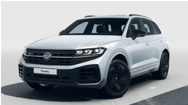
Oyster Silver Metallic