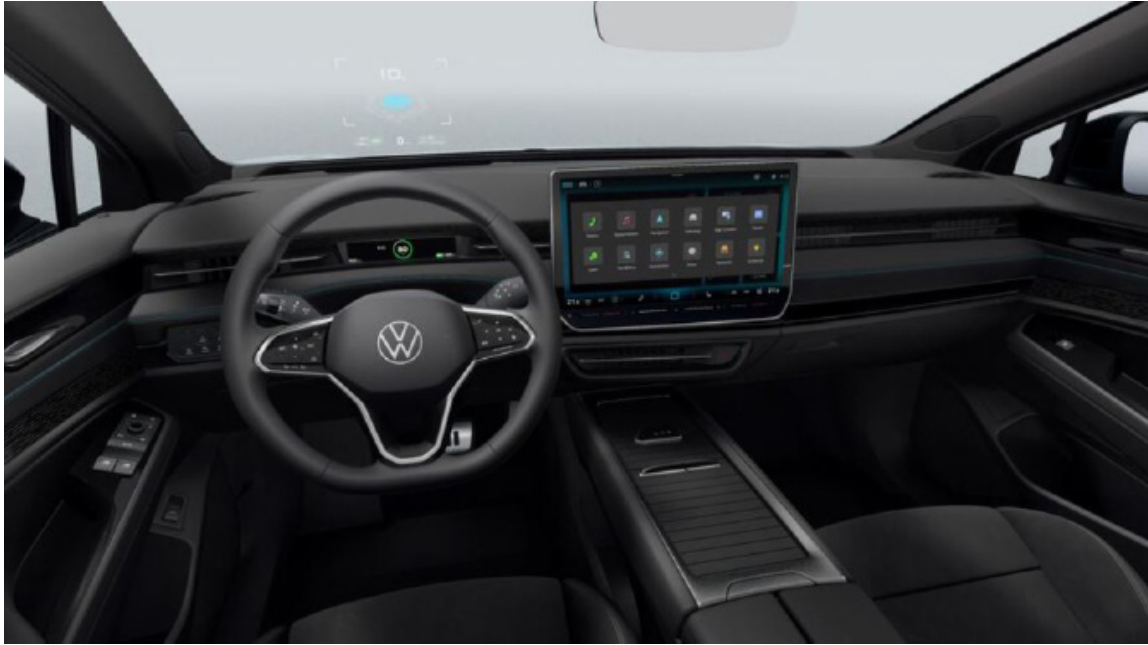
Soul Black (ZN) Standard from ID.7 PRO PLUS