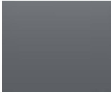
Moonstone Gray C2C2