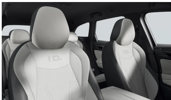
Inserts of front seats and outer rear seats in perforated ArtVelours ECO microfleece, seat bolsters in Artex Mistral / Soul Black (ZP) Optional from ID.7 PRO PLUS (forces option package PBF)

Note: The print processes do not allow exact reproduction of the upholstery & insert colours.