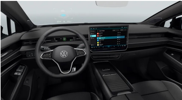
Soul Black (ZO) Optional from ID.7 PRO PLUS (forces option package PBF)