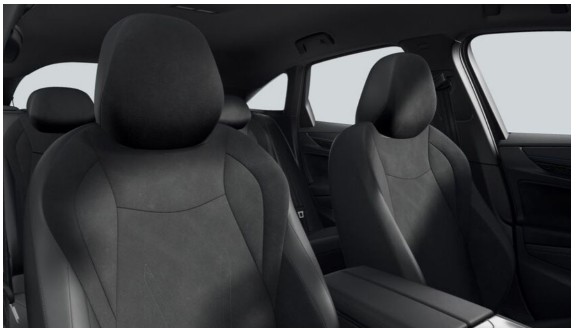
Inserts of front seats and outer rear seats in ArtVelours ECO microfleece, seat bolsters in Artex Soul Black (ZN) Standard from ID.7 PRO PLUS