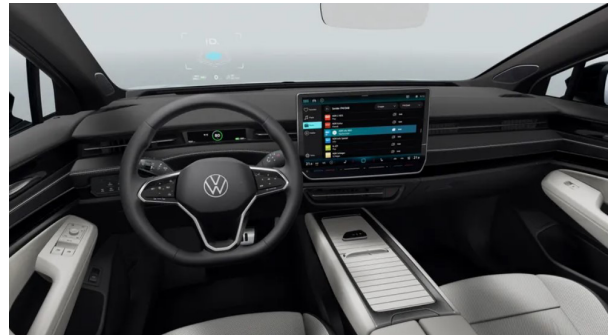
Mistral / Soul Black (ZP) Optional from ID.7 PRO PLUS (forces option package PBF)

Note: The print processes do not allow exact reproduction of the upholstery & insert colours.