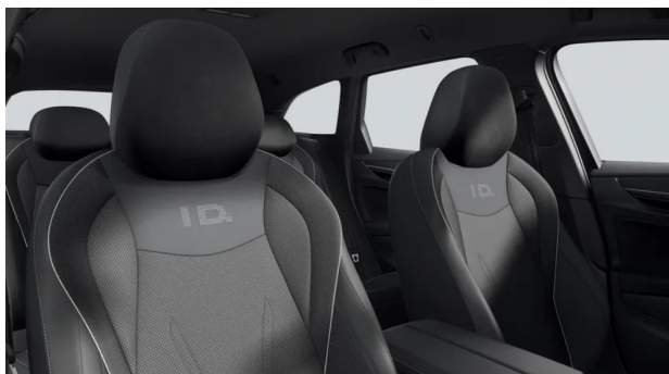
Inserts of front seats and outer rear seats in perforated ArtVelours ECO microfleece, seat bolsters in Artex Soul Black (ZO) Optional from ID.7 PRO PLUS (forces option package PBF)