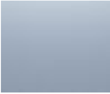
Stonewashed Blue Metallic 5Y5Y