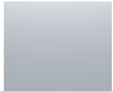
Scale Silver Metallic 1T1T